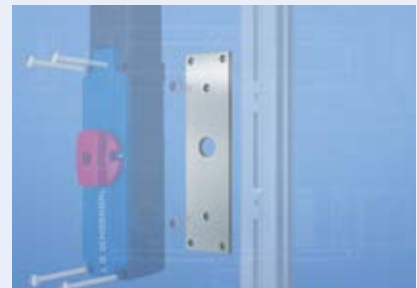
Mounting plate MP-AZM150-1 For simple mounting of an AZM150 on profile systems