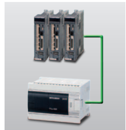
Direct motion control of up to three axes without further hardware

Mitsubishi Electric is the undisputed world leading supplier of compact PLCs. We originated the concept of this type of controller over thirty years ago. Our global installed base exceeds 12 million systems and our philosophy of listening to customer needs insures this base continues to grow. The introduction of the FX3U PLC set a new benchmark for performance and flexibility in the compact PLC market and we have continued to innovate. The result is the FX3G, our new answer to applications needing FX3U like capabilities in smaller scale systems.