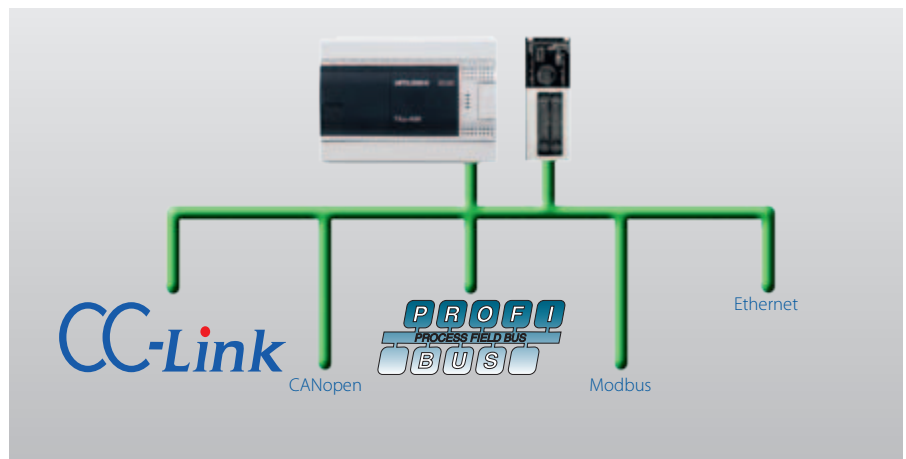
Comprehensive open network connectivity support

When it comes to increasing the capabilities of an FX3G, we extend your options while protecting your skills and investments. The dual bus architecture provides twice as many expansion possibilities compared to previous designs. On one bus, the FX3G uses additional, familiar FX family I/O and special function blocks to add a comprehensive variety of I/O and special function capabilities such as analogue and networking. On the other system bus, the FX3G uses the existing FX3U special adapters to provide high performance communication and analog capabilities that are directly linked to the CPU. This reduces programming while increasing performance, leading to faster development and higher productivity.