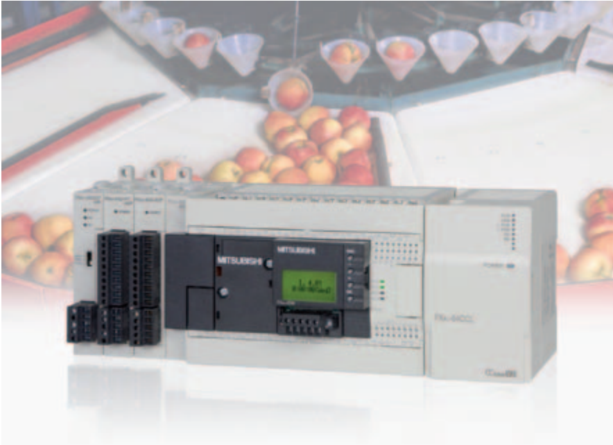
FX3G has the versatility to handle applications from a wide range of industries.

These include; a large program memory to implement sophisticated algorithms, ample space for data storage, logging or recipes, plus high speed execution to enhance system productivity. A dual bus architecture provides flexible expansion possibilities for additional I/O capacity and communication functions.