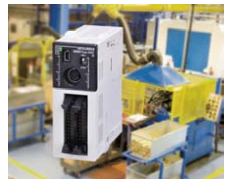
Application in smallest space: the FX3GC

The FX3GC is ideal for applications where space is minimal and power requirements are low, but without compromising the usability of the PLC system. Comprising an all in one CPU, power supply and I/O also means that this super compact product reduces installation space, wiring time and potential wiring faults, making it ideal for busy machine builders.