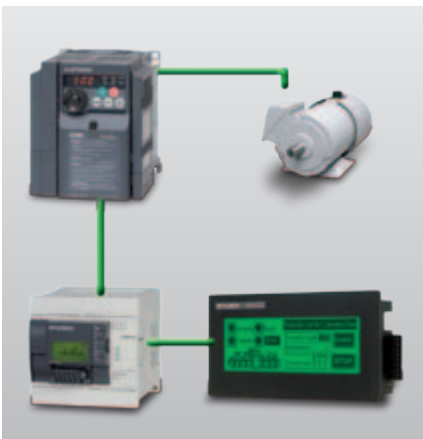
Precise motor control with digital links

Motion control is also simple to implement. The FX3G provides direct control of up to three independent axes without any additional hardware. Hence cost effective multi-axis systems can be built without requiring a costly controller overhead.